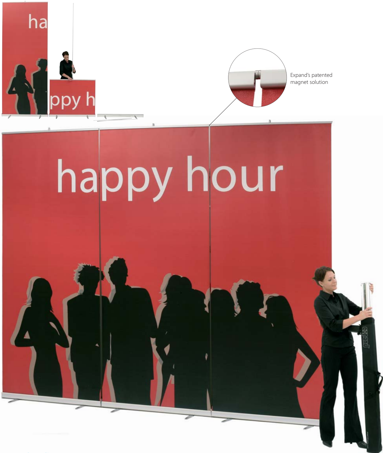
Expand's patented magnet solution